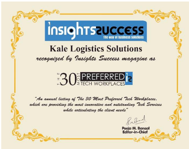
Kale Logistics Solutions gets featured in the list of "The 30 Most Preferred Tech Workplaces"