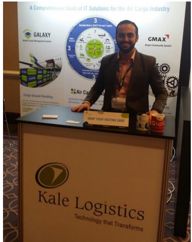
Kale Logistics Solutions exhibiting their state-of-the-art Air Cargo solutions at Air Cargo Handling Conference 2017 at Budapest